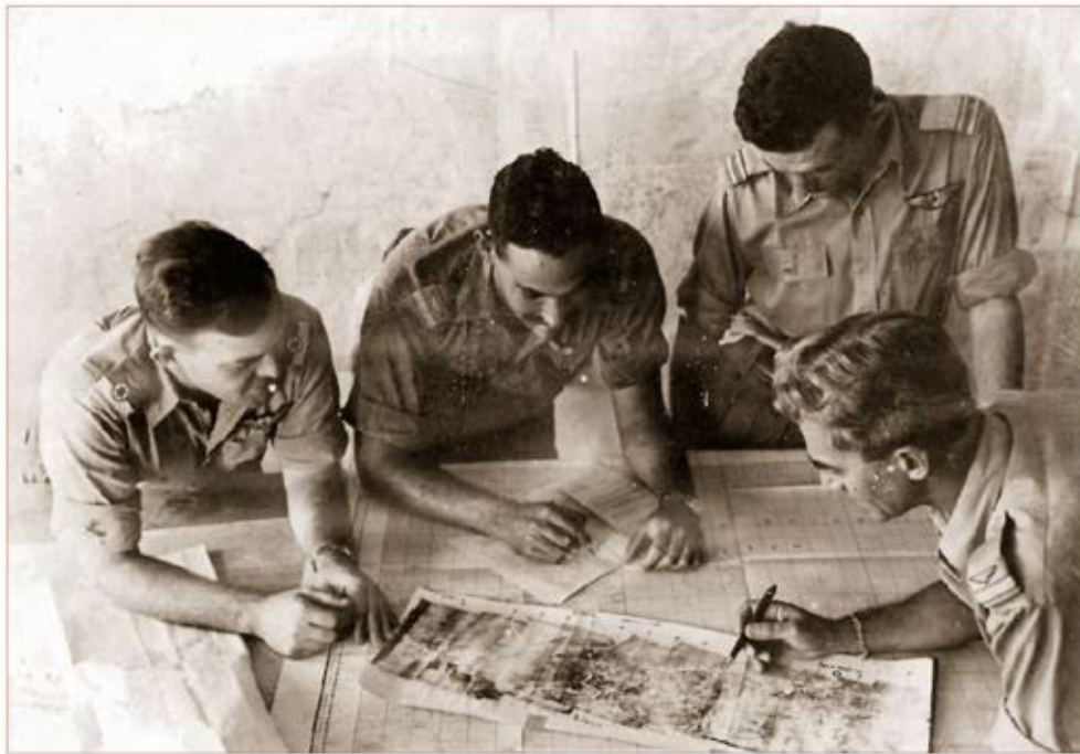
Above: Israel Air Force Command (1948)